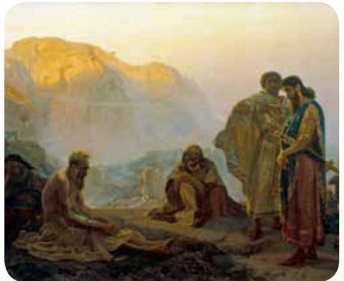
Ilya Repin, “Job and His Friends” (1869)

God says Job is an exceptionally upright, indeed blameless, man. When Job is accused of being good only because he has a prosperous, easy life, God demonstrates this isn’t so by taking away everything, including his children and his health. Job’s “so-called” friends accuse him of being a horrible sinner—why else would God bring such disaster on him? Job knows this isn’t so, and he remains faithful, but he does question why he has to endure such terrible suffering. Exactly the question we have.